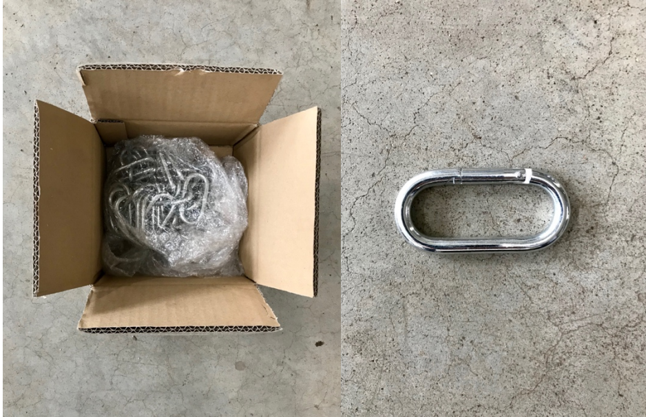
OILEX Carabiner (1 packaging unit with 50 carabiners)

*The OILEX binding agent is 100% organic, consisting of a hydrophobic biogenic sediment. Some technical data may therefore vary slightly. Its effectiveness depends on the substances that have to be absorbed. The applicable waste management laws have to be complied with.