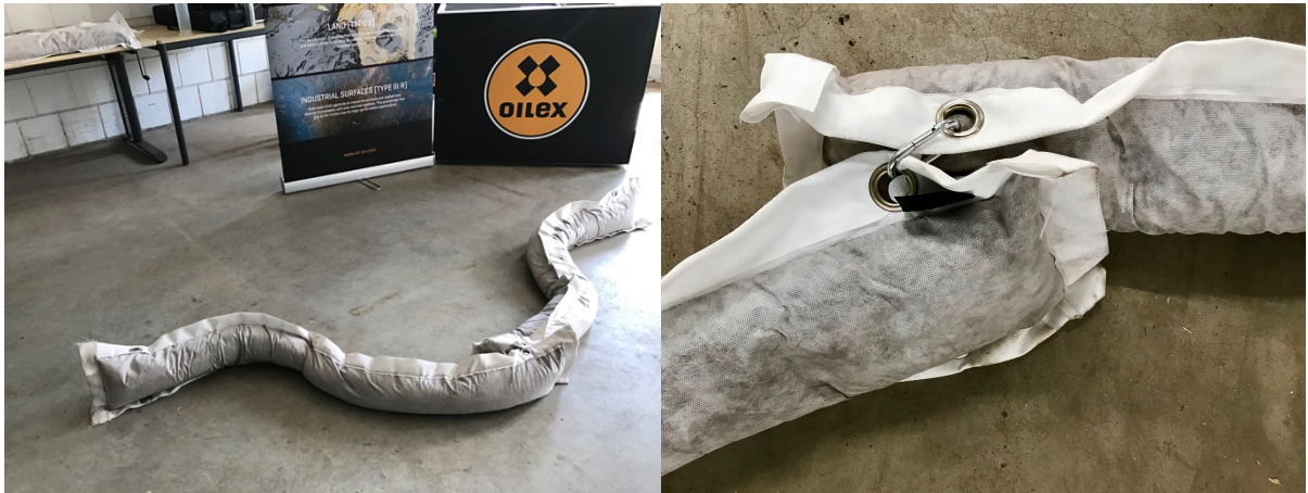
Oilex Boom with eyelets (150-120-60VM); connected to form a continuous barrier